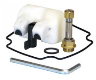
Service kit available

Corrosion resistant aluminium, EP coating